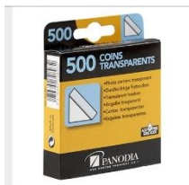
Example of corners to be used